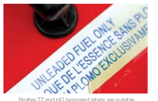
Brother TZ and HG laminated labels are suitable for the most demanding of applications