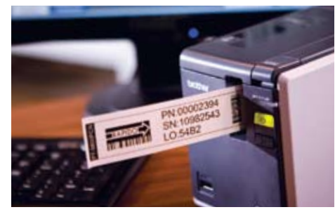
Microsoft Excel data can be merged with the label layout to print labels containing variable data