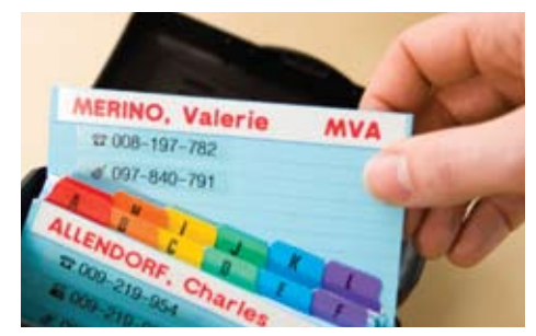
Find important information quickly through clear and precise labelling