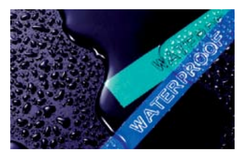
P-touch laminated labels are designed to withstand extreme conditions