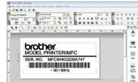
P-touch Editor 5 gives full control of label design which can include text, barcodes and images